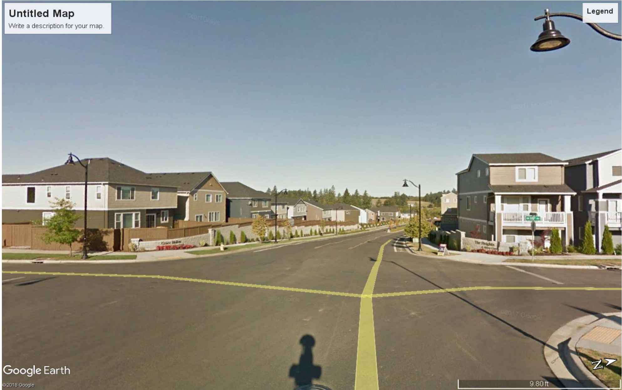
NW Shackleford @ NW 170th