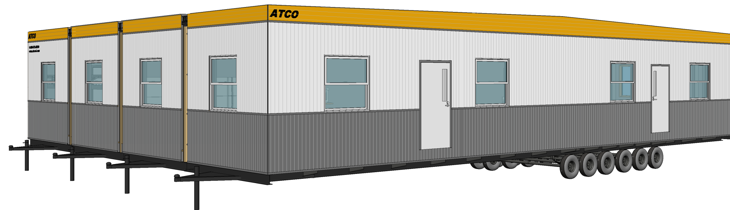
2 3D VIEW 2