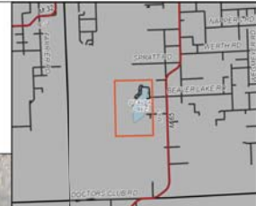
AREA MAP NOT TO SCALE