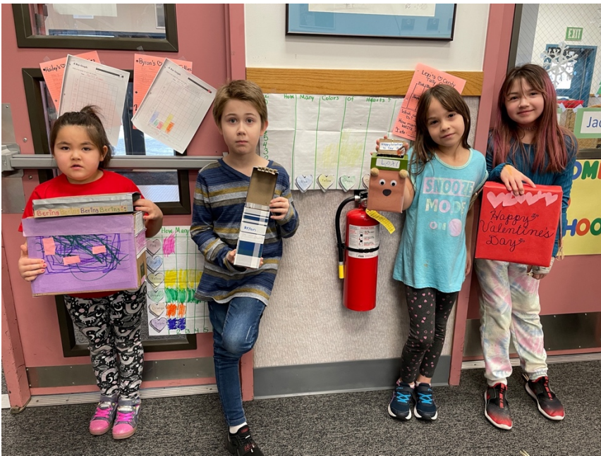
Valentine's Day Contraption Boxes