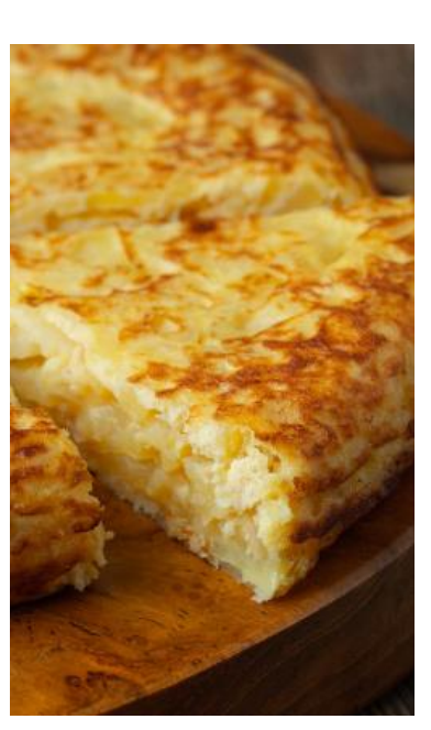
Spain: Sample Meals Spanish tortilla, pork loin with potatoes and mushrooms, ice cream Lentils, pork loin, crema catalana