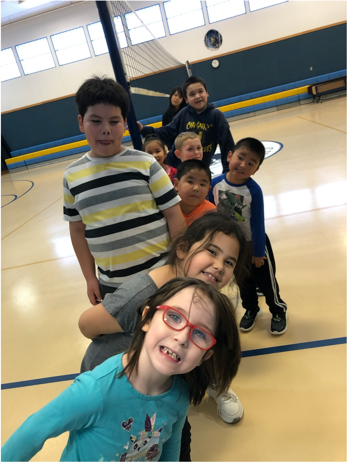
See? The volleyball net is still up!