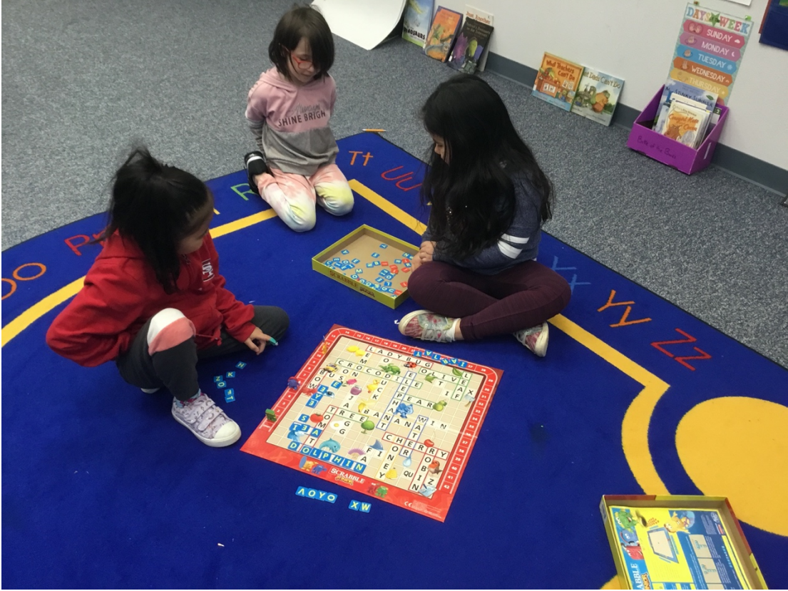
Practicing letters is fun!