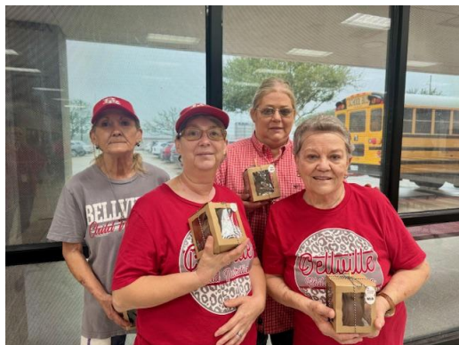
Bellville Junior High