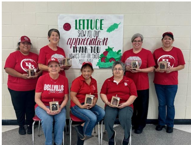
Bellville High School