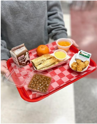
Chicken and Cheese Crispos