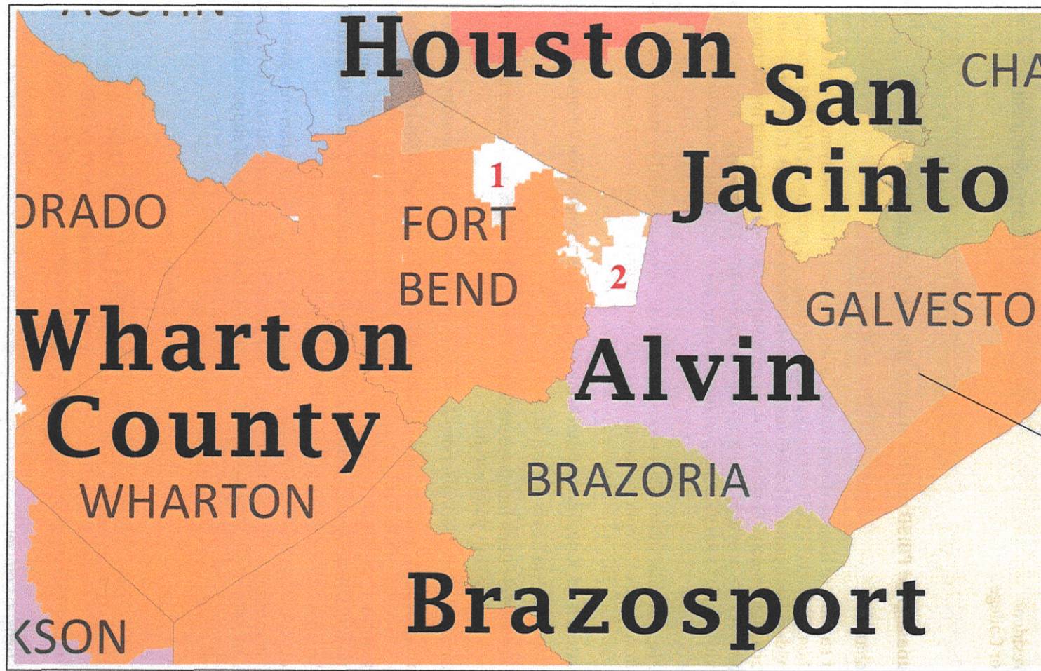
Exhibit 1: Houston Community College System's existing Service Area in relation to adjoining community colleges