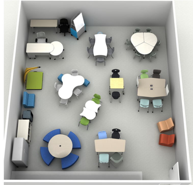
Sample vendor layout at showcase