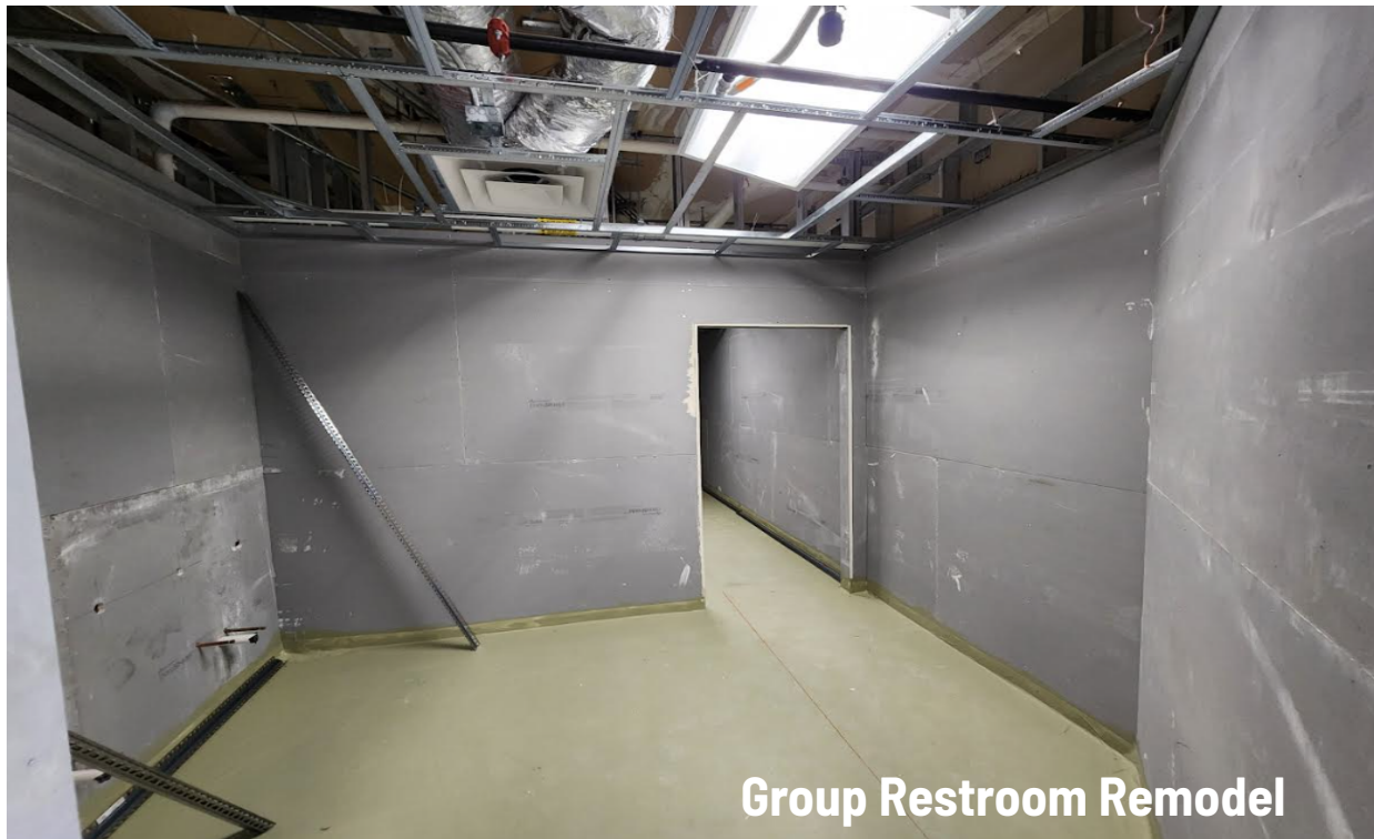
Group Restroom Remodel