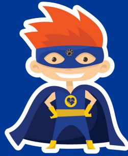
ROBIN THE RESPECTFUL