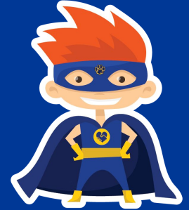
ROBIN THE RESPECTFUL