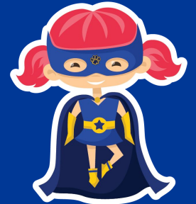
AMY THE ATTENTIVE