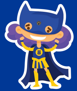
OLIVIA THE ORGANIZED