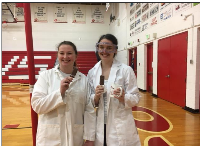
Art, Science and Math teachers show school spirit!