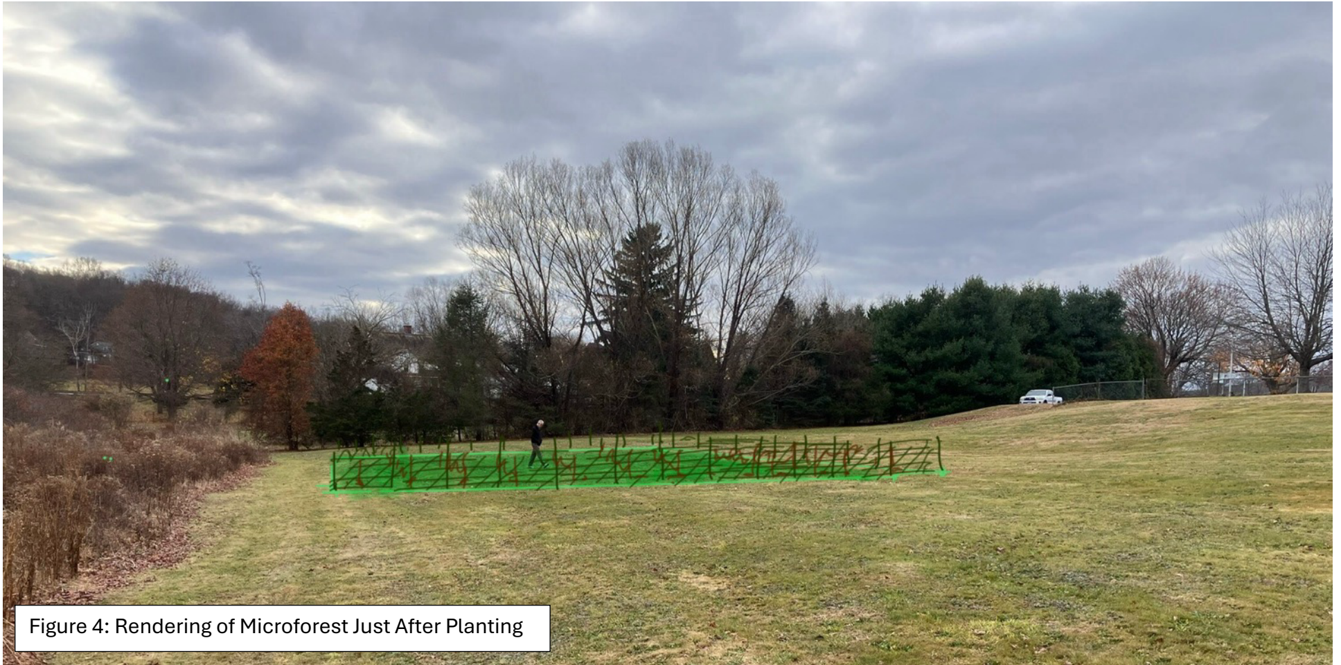
Figure 4: Rendering of Microforest Just After Planting