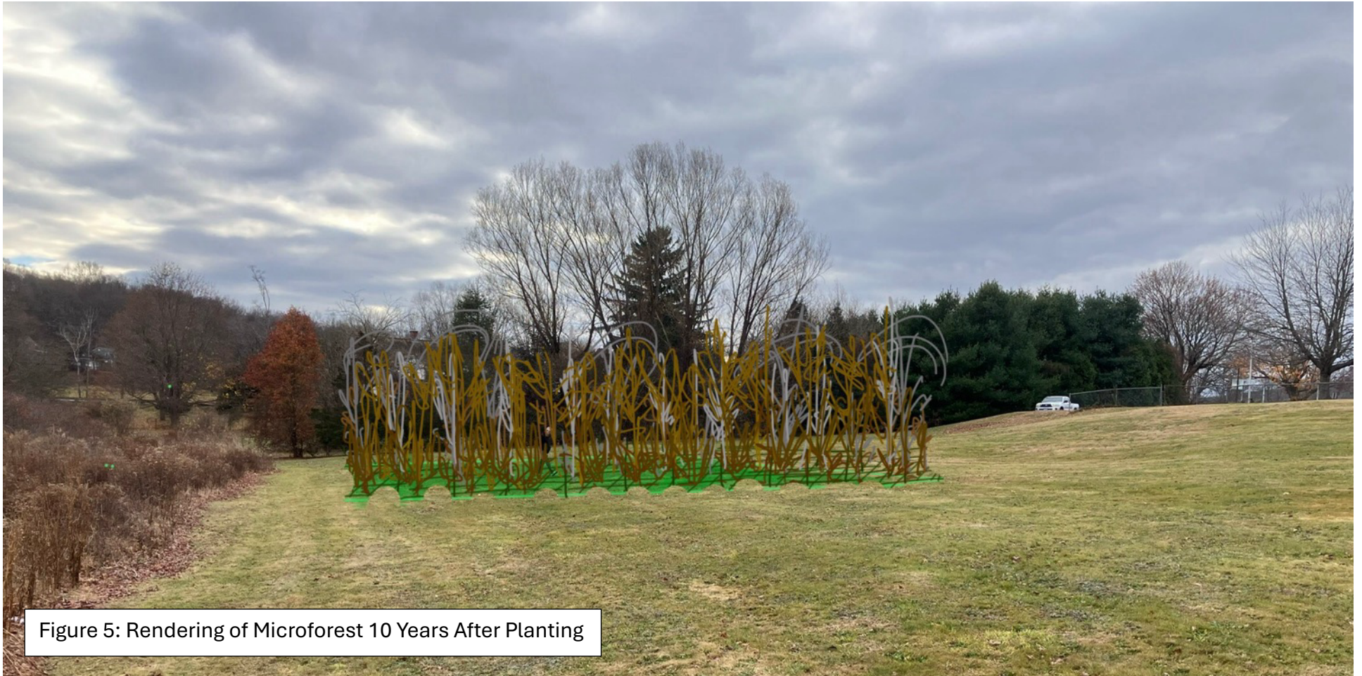
Figure 5: Rendering of Microforest 10 Years After Planting