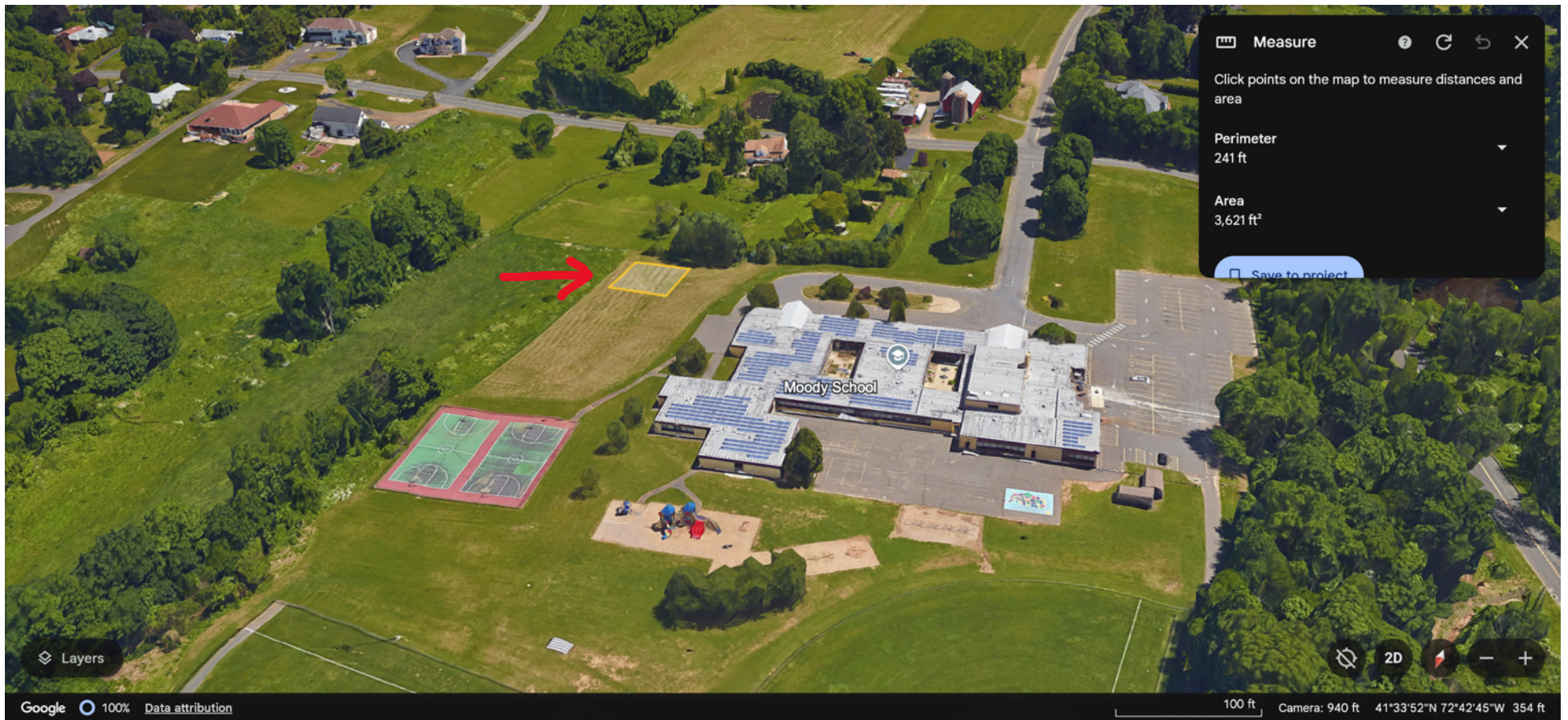
Figure 3: Google Earth Aerial Image Showing Proposed Microforest Location (3D)