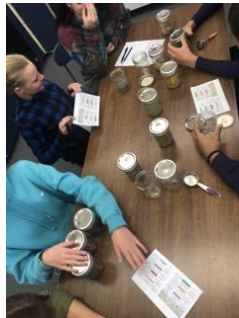
Week 2 - Tongass Tinctures and Botanicals - making medicine from plants