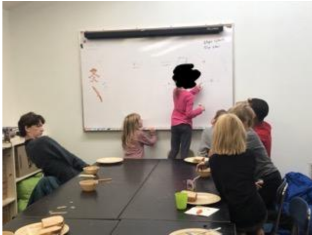
K-12 hangman fun at lunch time!