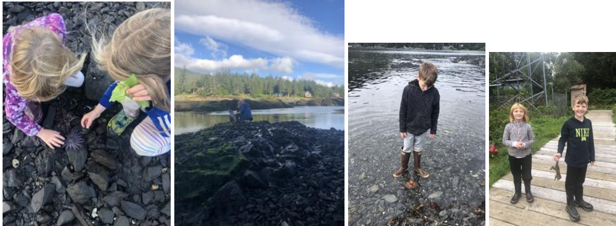
Low Tide Field Trip and afterschool squirrel hunting