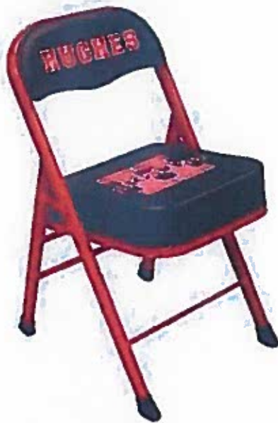
Deluxe Sideline Chair.....$92 and a 24 minimum SKU 1307252