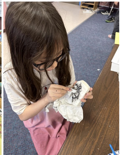
K-5 Students and teacher enjoyed some time on culture projects, including scrimshaw practice!