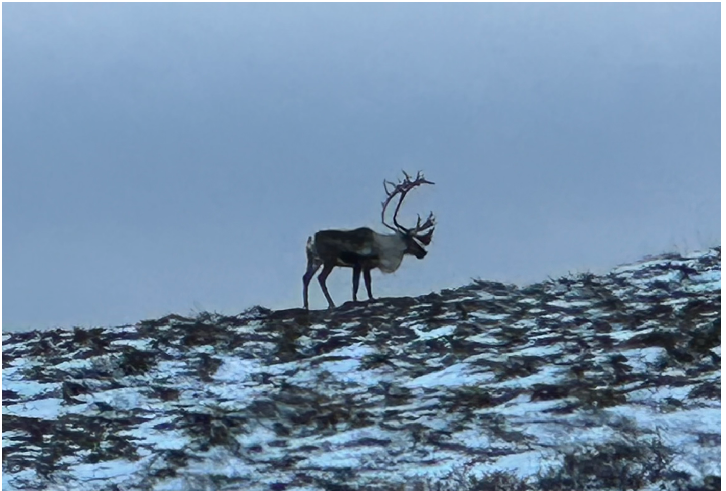
Port Heiden Caribou