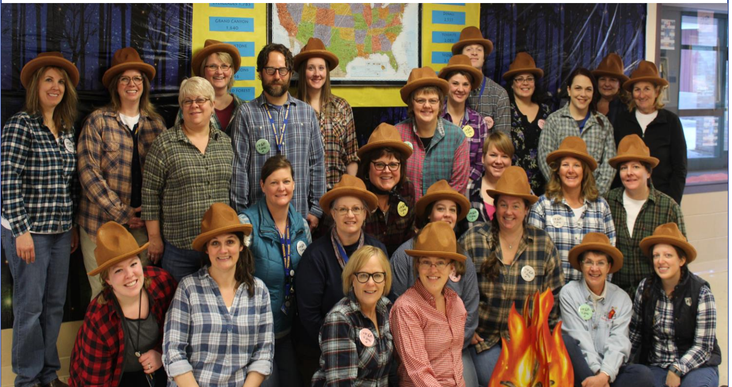
The Staff Rangers heading out on the Adventure!