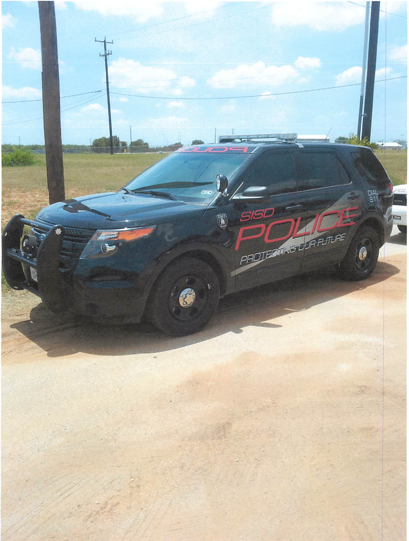
5622 Ray Ellison Blvd. San Antonio, Texas 78242 Office: 210-977-7500 Fax: 210-9777112