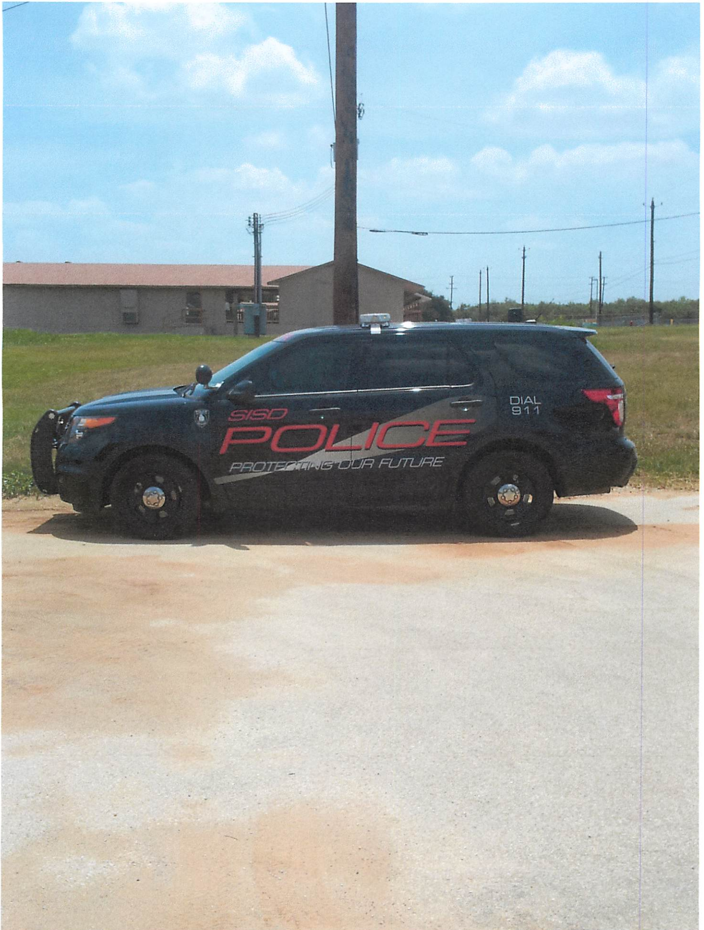
5622 Ray Ellison Blvd. San Antonio, Texas 78242 Office: 210-977-7500 Fax: 210-9777112