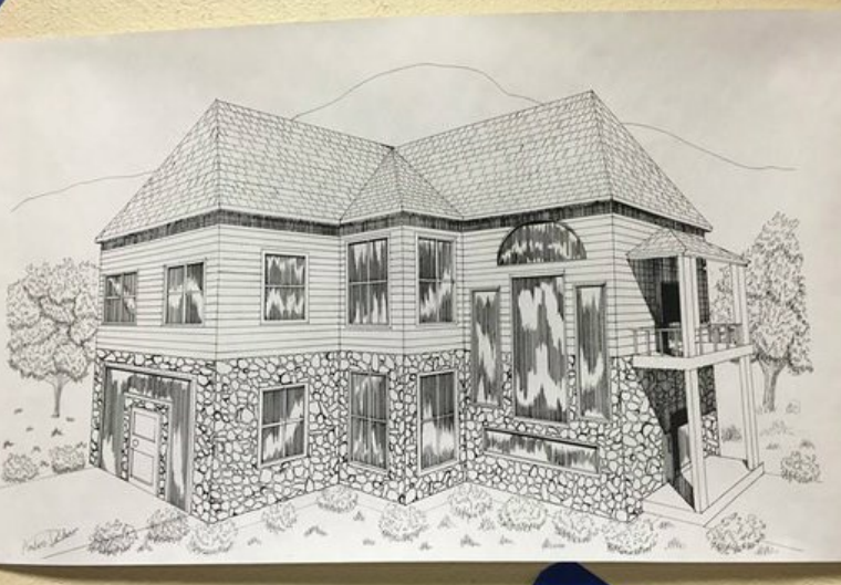
Left, right, & below: Work samples from North Valley HS' drafting class show off some major student talent.