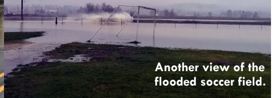
Another view of the flooded soccer field.