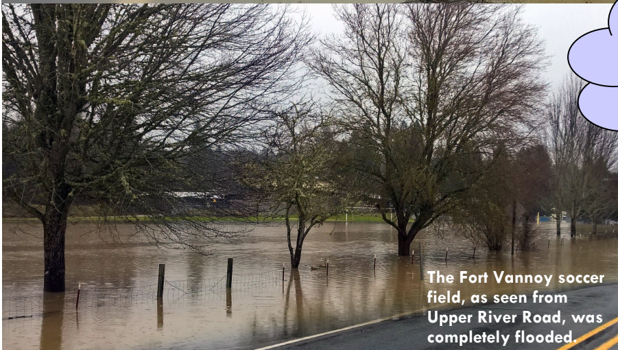
The Fort Vannoy soccer field, as seen from Upper River Road, was completely flooded.

December and January combined for 22.35 inches of precipitation in Grants Pass—nearly twice the average of 12 inches, and the 4th highest December-January total since 1950.