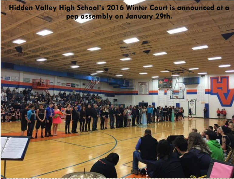
Hidden Valley High School's 2016 Winter Court is announced at a pep assembly on January 29th.