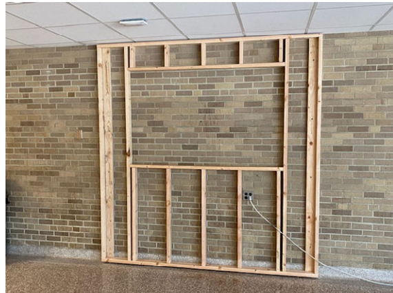
The new information center will be mounted on the wall just outside the gymnasium.