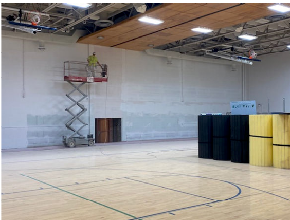
Gymnasium painting is underway.