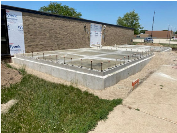
The foundation and floor are both ready for the new classroom addition.