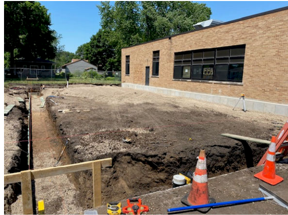
The foundation is being poured for our very large greenhouse.