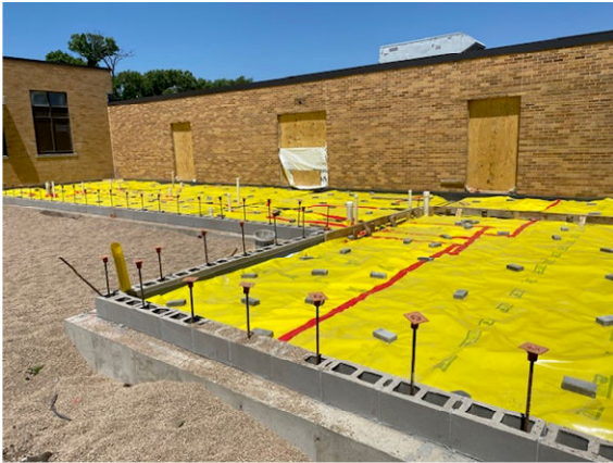
The foundation is in place for the new athletic training room and lockerroom expansion.

King Construction is making good progress.