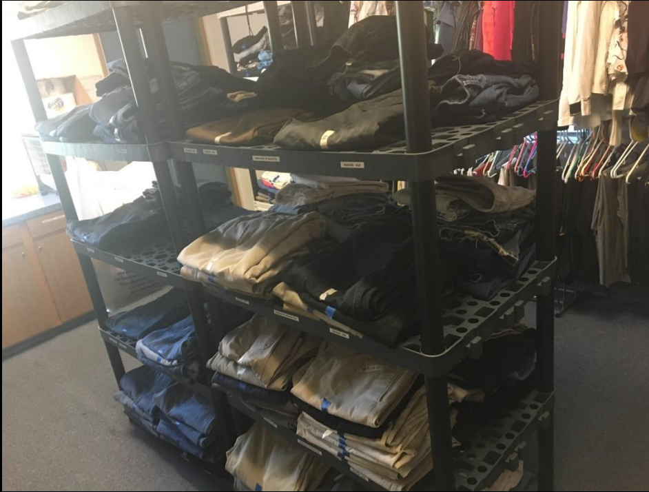
Men and Women's Jeans