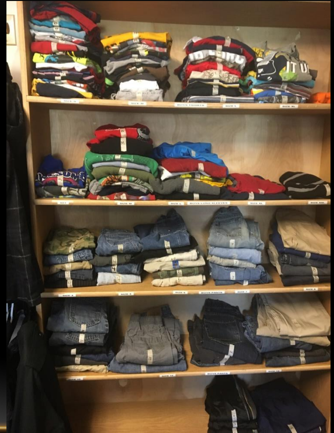
Boys Jeans and T-shirts