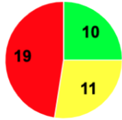
Fall Math 22-23 Benchmarking