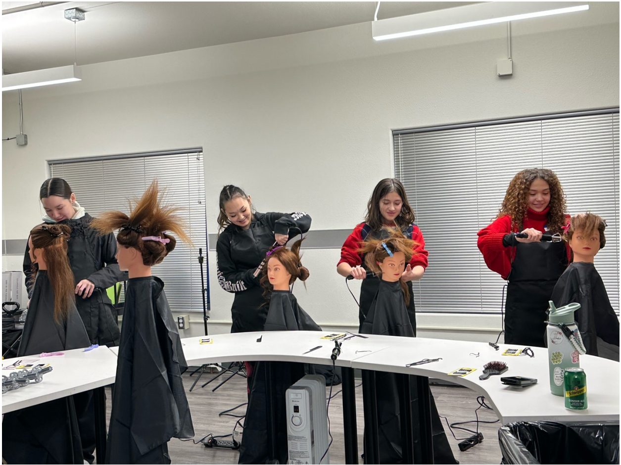
Girls participating in cosmetology