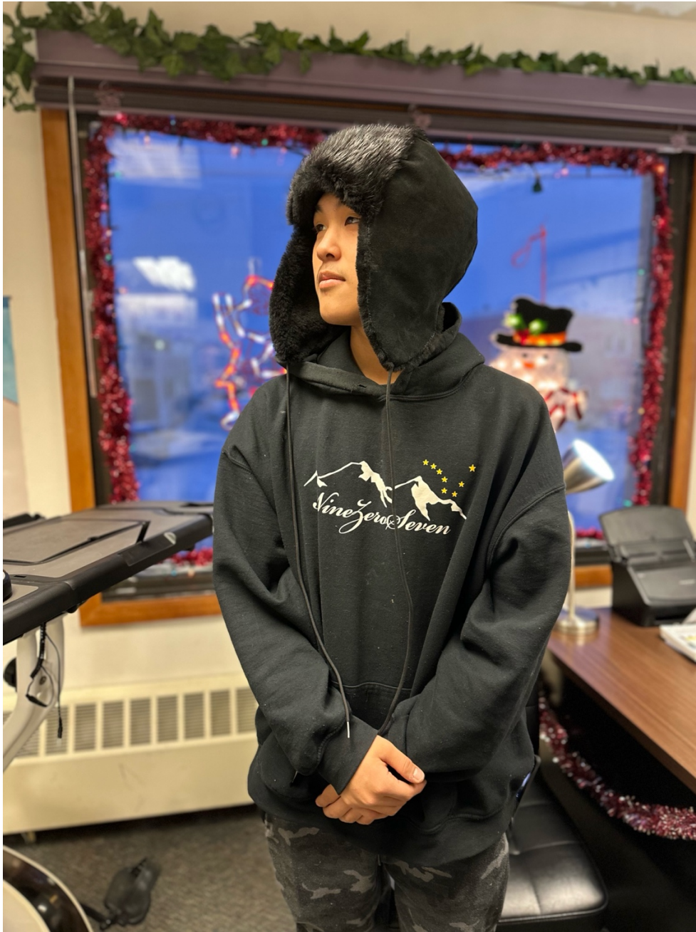
Student modeling hat sewn in class