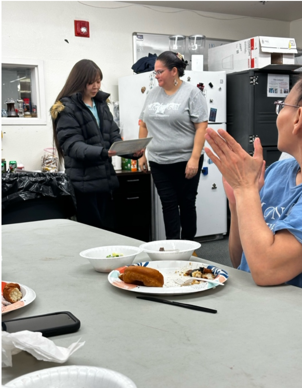
Awards ceremony w/ one of our December graduates.