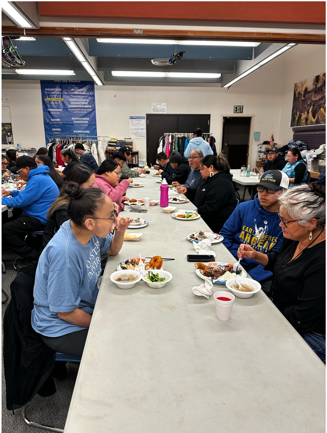
Awards ceremony meal w/ guests.