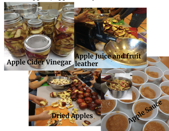
Apples, Apples Everywhere!

Apple, Apples, and More Apples: One of the goals and objectives of these grants is to support youth in learning about local traditions and resources. To support this, we have chosen to teach our youth about food harvesting and preservation. On Thursday, October 6th, Coffman Cove School hosted 5 of our schools for an all day apple harvesting and processing event. Staff and students picked and processed so many apples!! A huge SHOUT OUT to the Coffman Cove staff for hosting a MARVELOUS event!