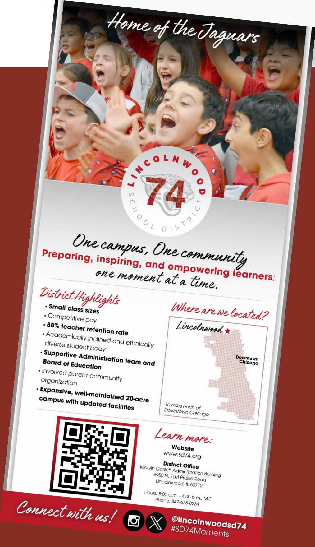
Career Fair banner and trifold