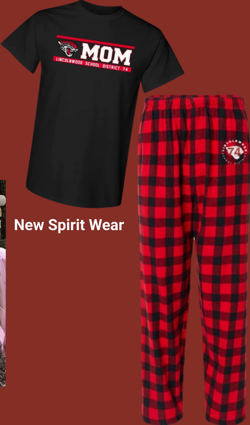
New Spirit Wear