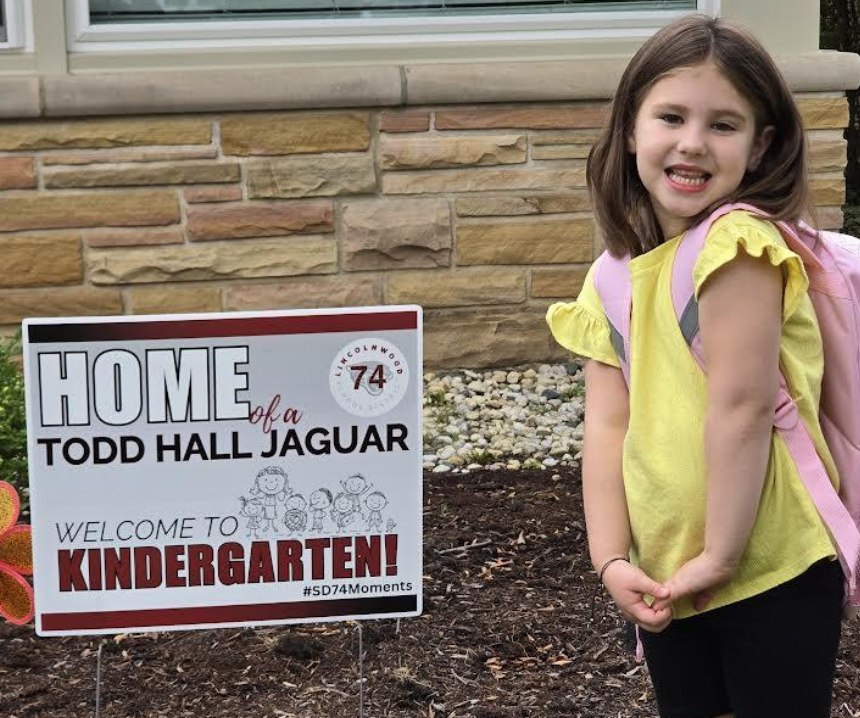
'Welcome to Kindergarten' year sign