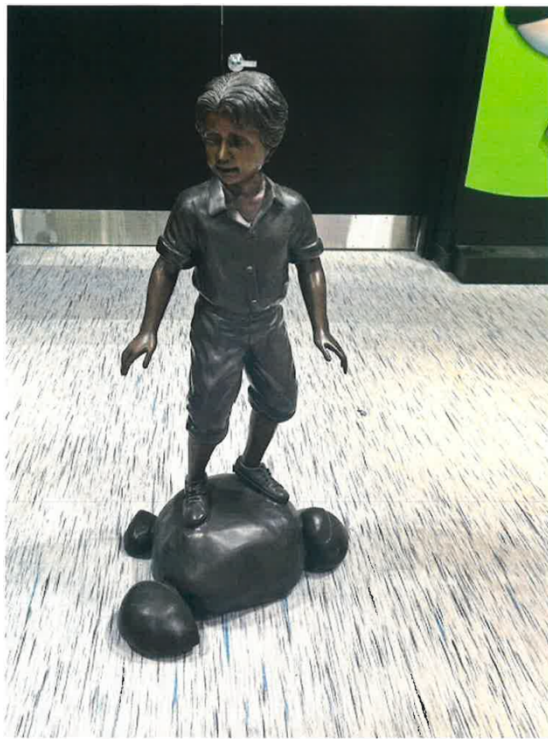
Sculpture 2 Boy with rolled pants leg