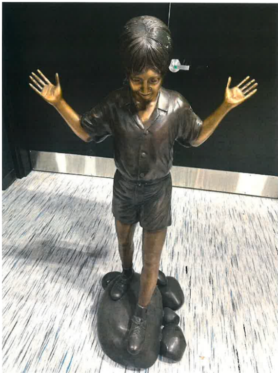
Sculpture 1 Tall girl in shorts