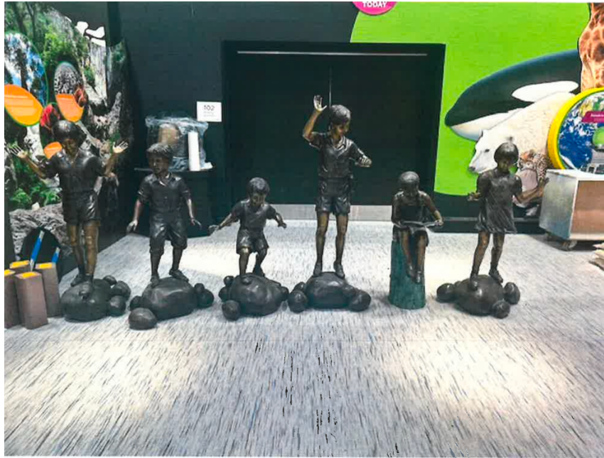
All six sculptures