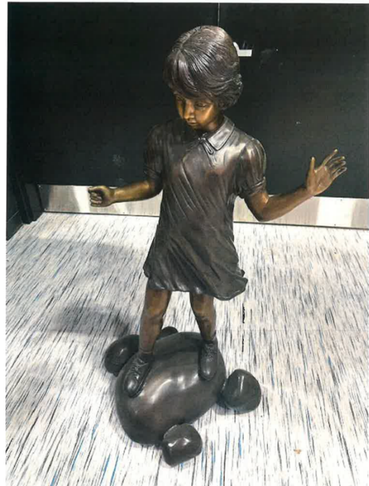
Sculpture 6 Girl in dress