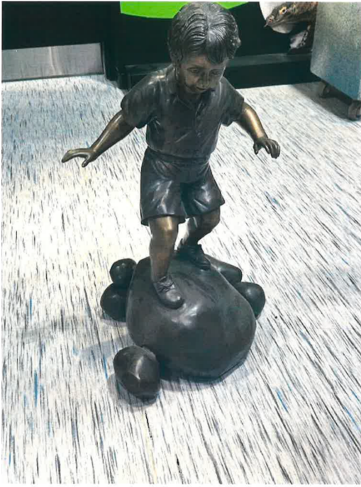
Sculpture 3 Small boy in shorts