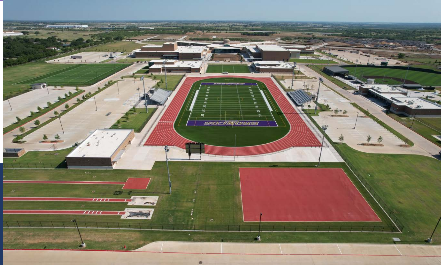
DENTON HIGH FOOTBALL FIELD & TRACK AERIAL