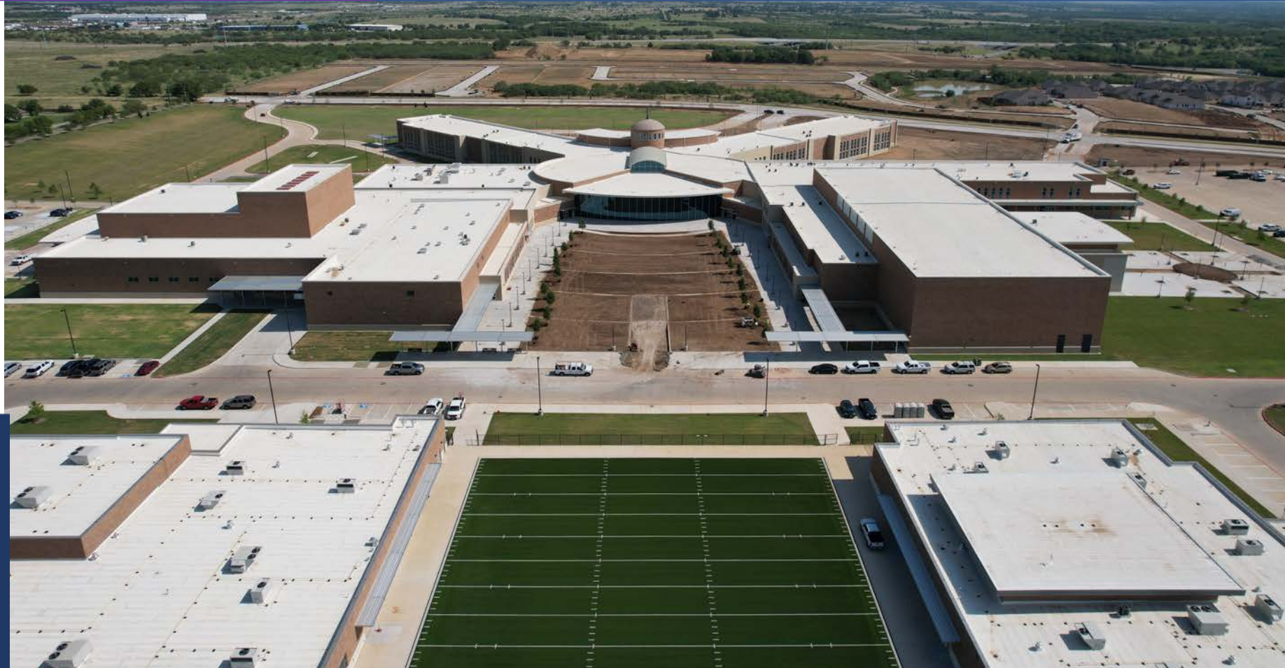
DENTON HIGH SCHOOL REAR AERIAL