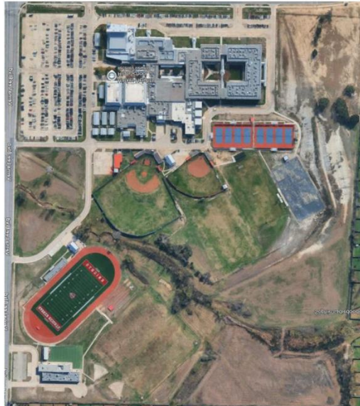
Figure 1, Aerial view of Harker Heights High School campus, Harker Heights TX.

EE understands that KISD is requesting design and construction services at Harker Heights High School for the repair scope described in the report provided by Unified Building Sciences dated August 20, 2024, and our subsequent discussions.