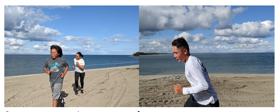
Cross-country practice on a sunny afternoon.