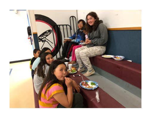
Students enjoy supper together.