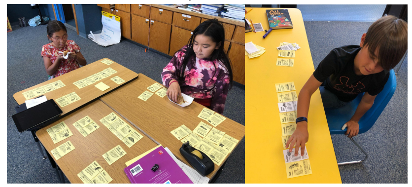
Mystery Science Lesson: Eat or Be Eaten