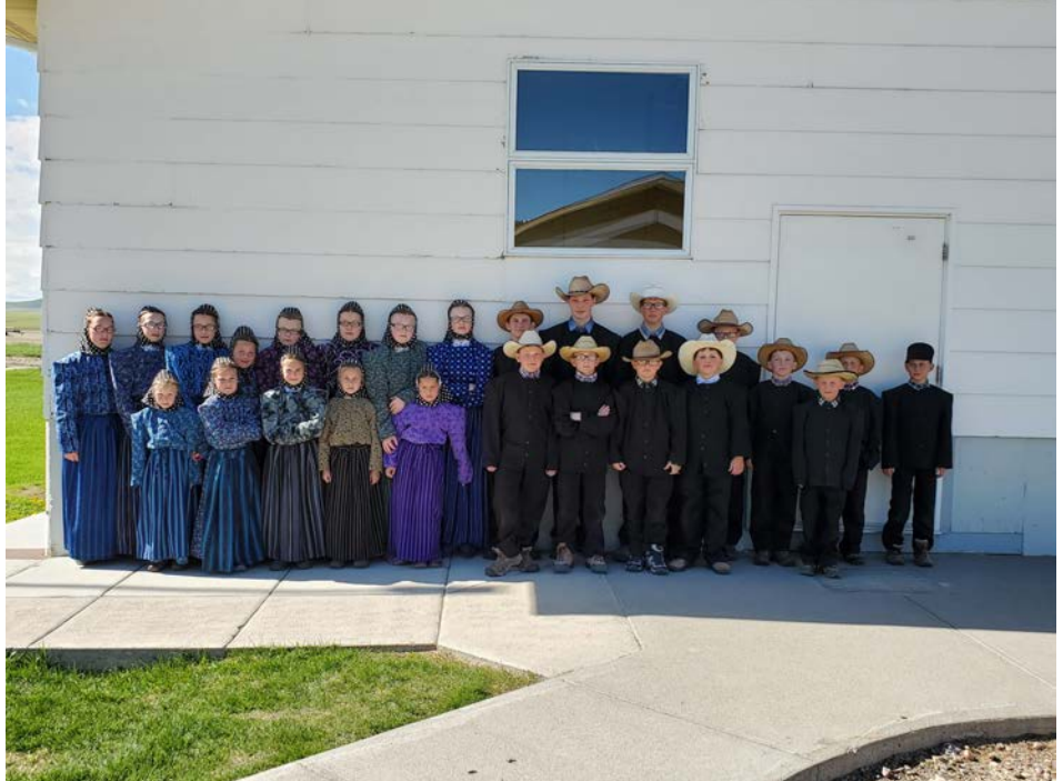
Students at Big Sky School 2020 End of year- a few were unable to be in this photo