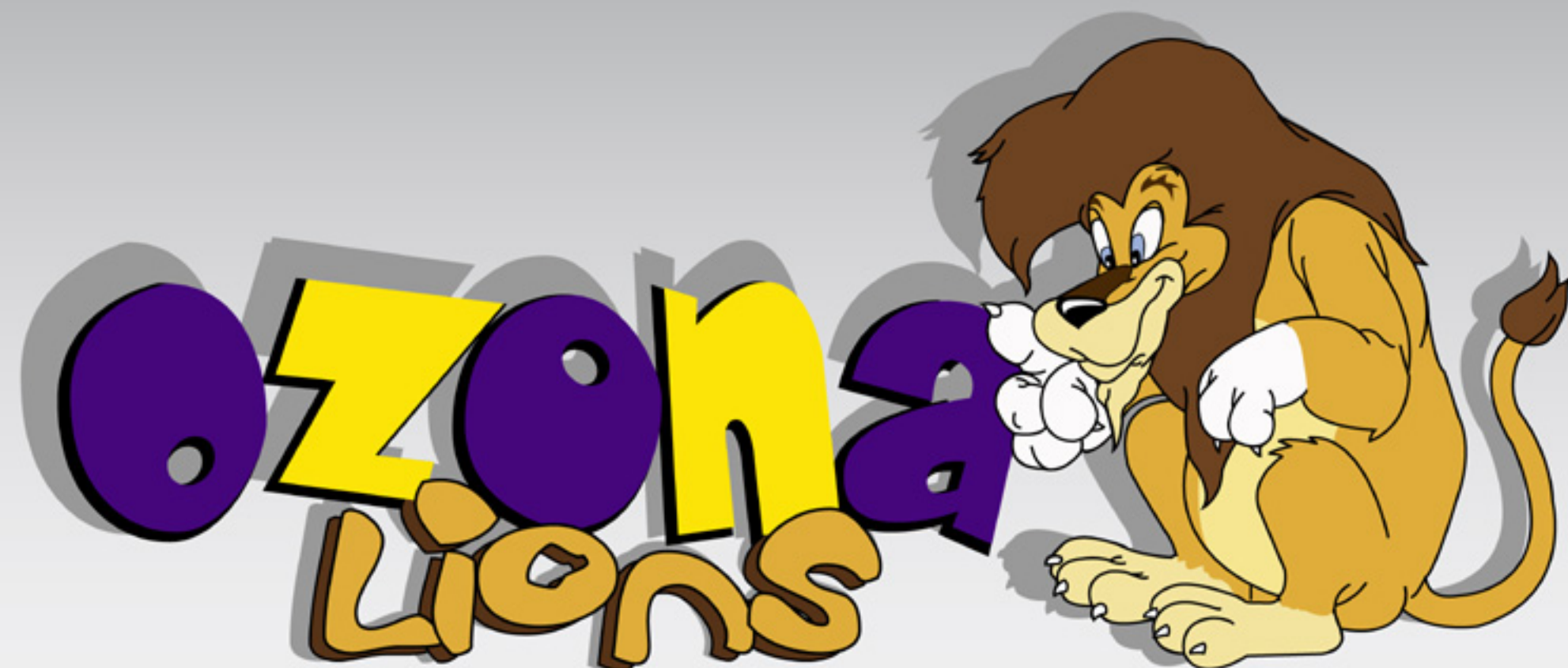
Pre School wall