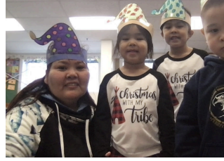
Perryville Pajama Party with Math & Literacy