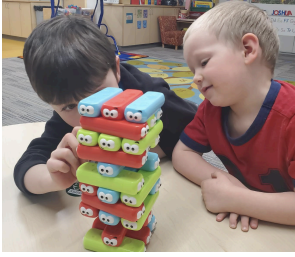
Tanalian Game Time & Taking Turns