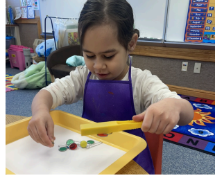
Chignik Lagoon Exploring Magnets