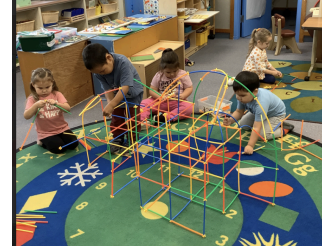
Newhalen Cooperative Learning & Teamwork