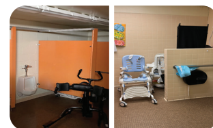
Inadequate Restrooms: Restrooms are small, difficult for mobility devices, and not adjacent to classrooms