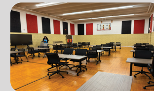
Lack of Activity Space: Limited space available for events and activities