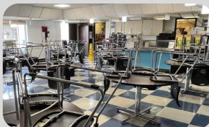
Small Cafeteria: Cannot accommodate student groups and has limited functionality