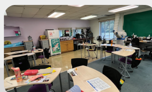
Undersized Classrooms: Limited space restricts therapy and impedes learning