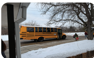
Weather Exposure: Pick-up and drop-off areas lack weather protection