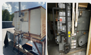
Aging Mechanical Systems: Mechanical systems are at their end of useful life