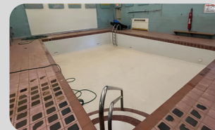
Non-Functioning Pool: Pool area is non-operational and unsuitable for water therapy