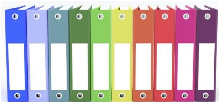
Ages & Stages Questionnaires