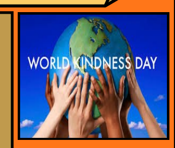
November 13, 2020

Help support Fleming and get your Vitamin C! Order some California tree ripened navel oranges and Texas Rio Star grapefruit! $35.00 for a 20# box. Orders are due by December 1st. Call the office to order! Fruit pickup is December 12th.