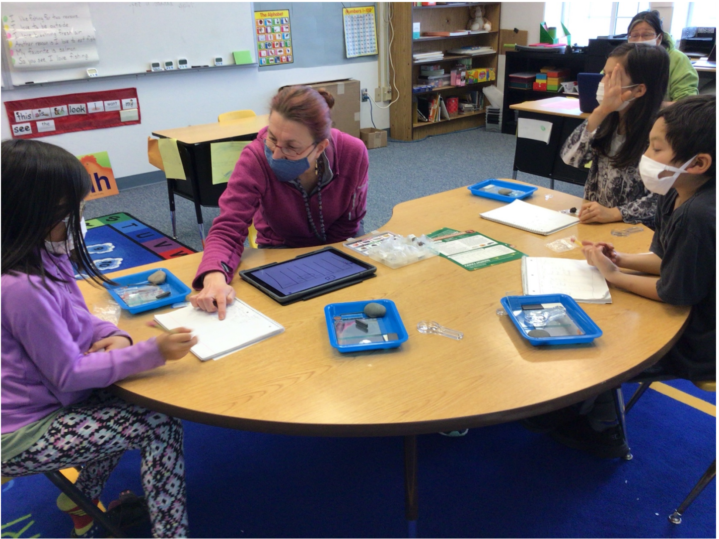
Figure 1 Earth Science