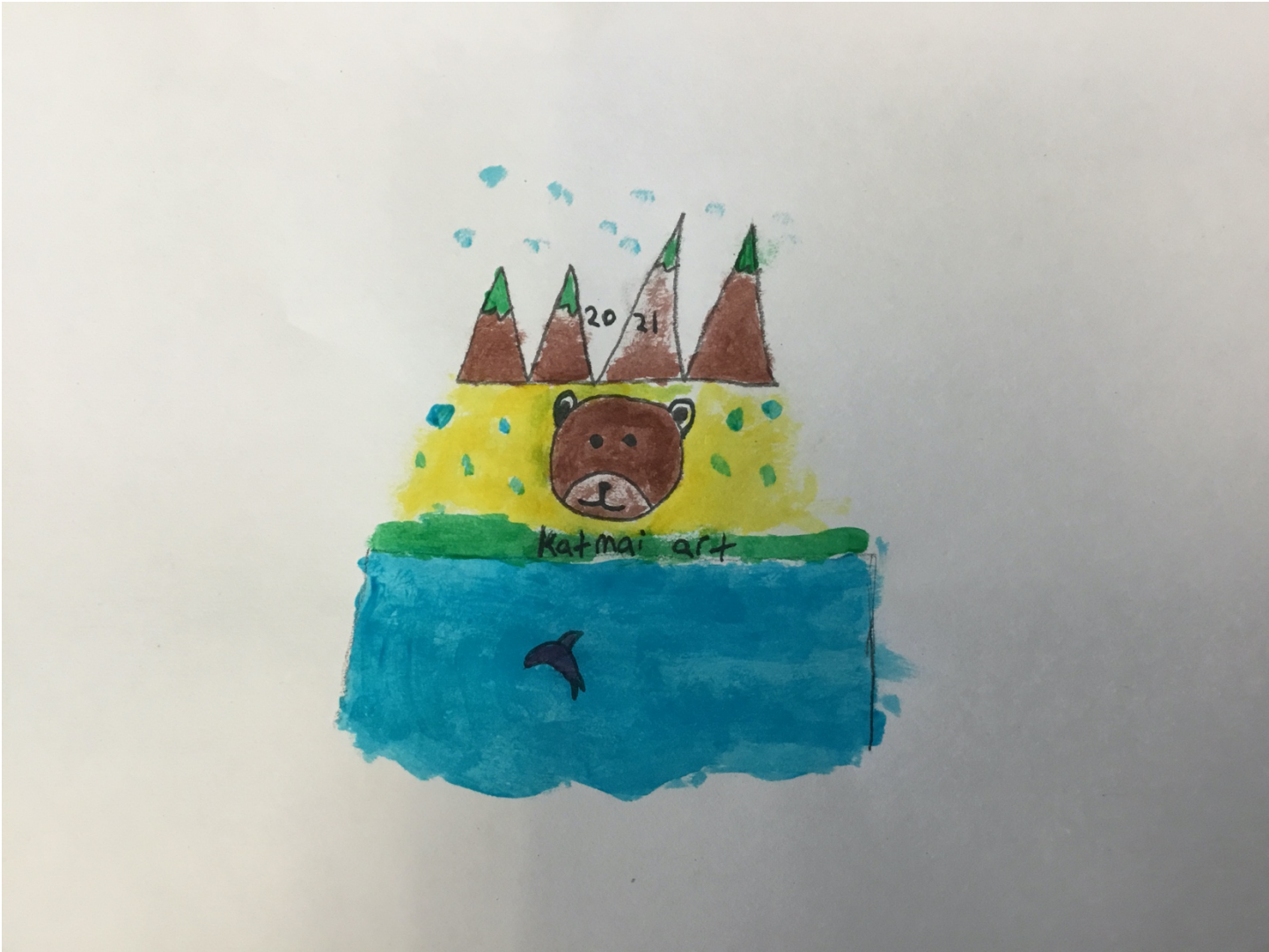
Chignik Lake 2 Katmai Pin Art Entry