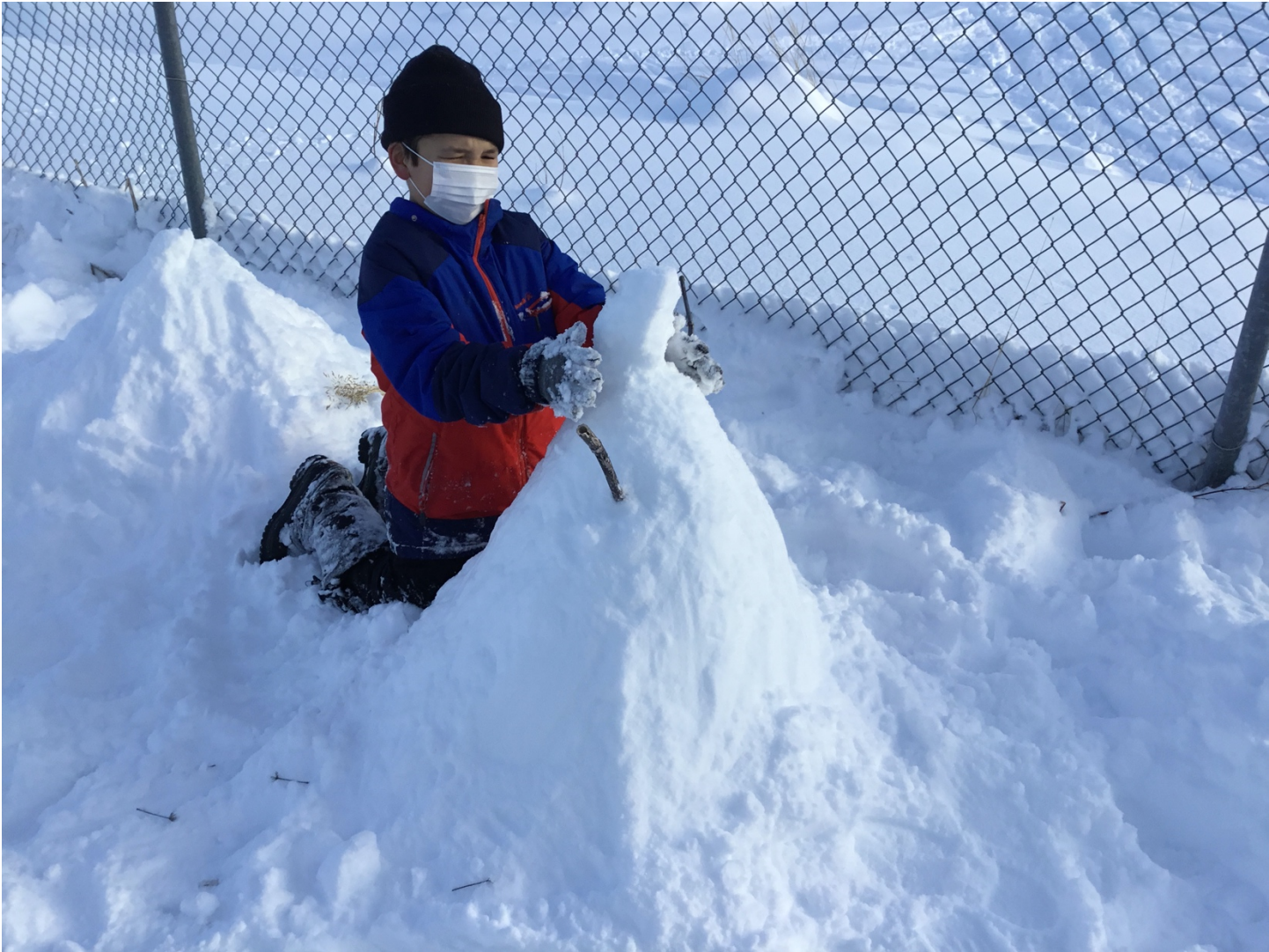
Chignik Lake 5 Taking advantage of fresh air on a sunny day