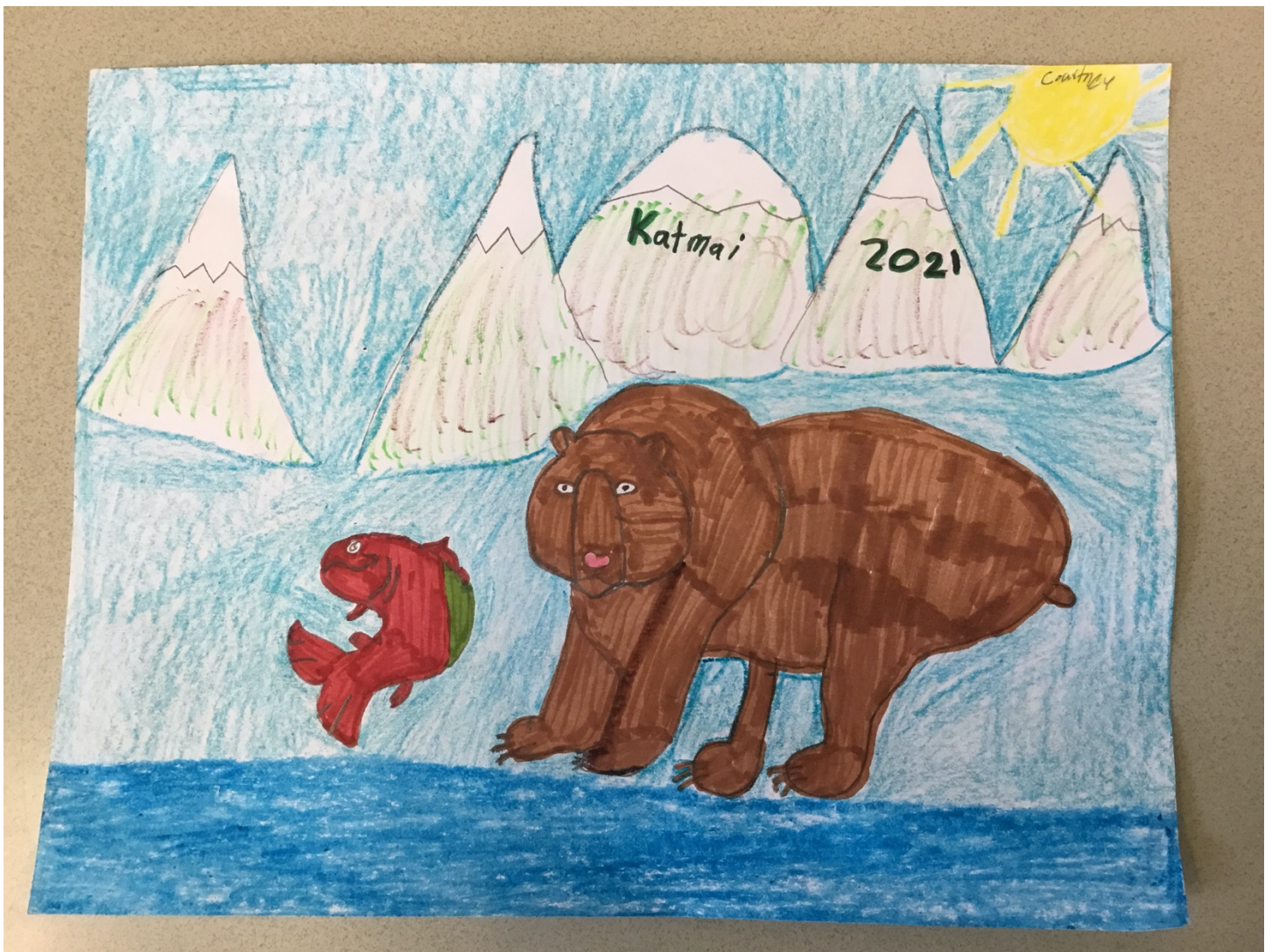
Chignik Lake 1 Katmai Pin Art Entry