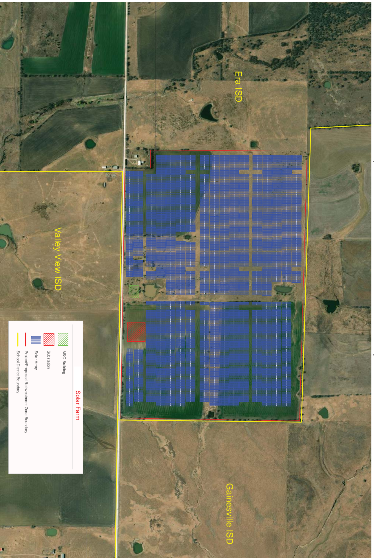
Map of Qualified Investment & Qualified Improvements