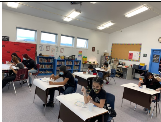
Students in Science Levels 3-8 Dissecting Owl Pellets. Those masks come in handy!

Five items we request the board consider: