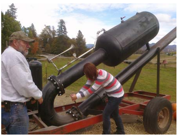
Physics Students at the Pumpkin Cannon!