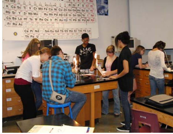
Chemistry Students working in the Lab