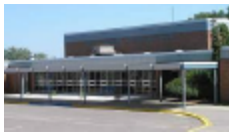
Kennedy Elementary Grades K - 4

1000 West 11th Street, Hastings, MN 55033 (651) 480-7060