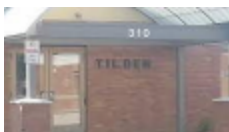
Tilden Community Center Early Learning Programming, Adult Education, Family Education, Community Education

975 West 12th Street Hastings, MN 55033 (651) 457-9426