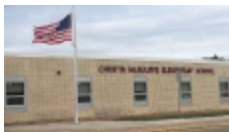
McAuliffe Elementary Grades K - 4

1175 Tyler Street, Hastings, MN 55033 (651) 480-7220