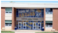
Hastings Middle School Grades 5 - 8

200 General Sieben Drive, Hastings, MN 55033 (651) 480-7470 (651) 480-7690