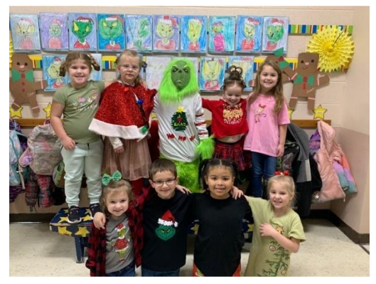
Grinch Day in Kindergarten.....