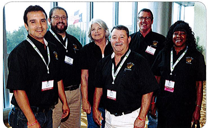
Italy ISD Leadership Team

All Post-Legislative Conference attendees also will receive a copy of the TASB 2015 Legislative Summary for School Officials when the final document is published. TASB's Legal Services and Governmental Relations staffs will work together to summarize major provisions of each piece of legislation affecting public schools.