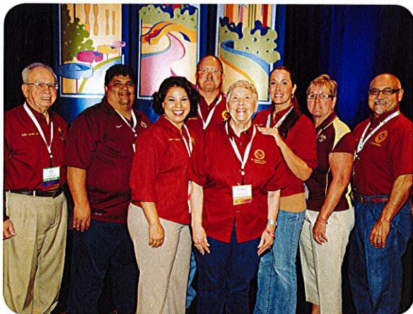
Tuloso-Midway ISD Leadership Team

Let everyone in your community know what serving on the school board is all about, and show them what you are doing to learn more about public education and leadership to benefit the schoolchildren in your area.