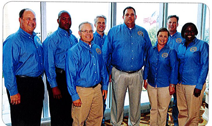
Sulphur Springs ISD Leadership Team

Both general session speakers will have books for sale and will be available for signing following their presentation.