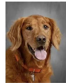
Murphy Therapy Dog

10th-12th Grade Students with last name P-Z