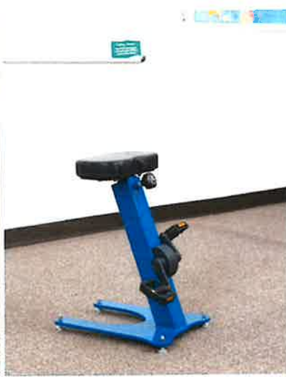
STUDENT PEDAL DESK and STUDENT PEDAL STOOL

Student Pedal Desks for middle and high school classrooms include adjustable resistance to accommodate all physical capabilities. Tabletop and seat height adjust. The pedal desk is the #1 most popular desk for middle and high school classrooms. The pedal motion is similar to a bicycle and students and teachers love it! Students pedal while they participate in regular classroom activities, and since the pedals are silent, they don't interfere with classroom instruction or activities.