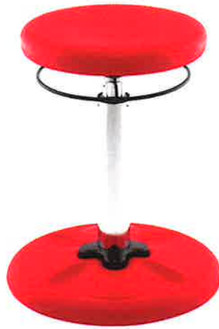
COLLABORATIVE STUDENT TABLE SET and ADJUSTABLE WOBBLE CHAIRS

4 PC XL Wave Table Set allows for various arrangements, for quick transition from individual to group work. Reinforce collaborative learning and enhance team building in the classroom. This portable table is perfect for collaborative learning environments and supports educators in setting up a variety of classroom arrangements. Use end tables to form Yin/Yang circular arrangement, combine center wave tables for smaller groups, use individually for partner work! *4 tables total: 2 Wave Tables & 2Yin/Yang Tables.