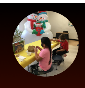
Will be provided for attendance & behavior w/ all students eligible