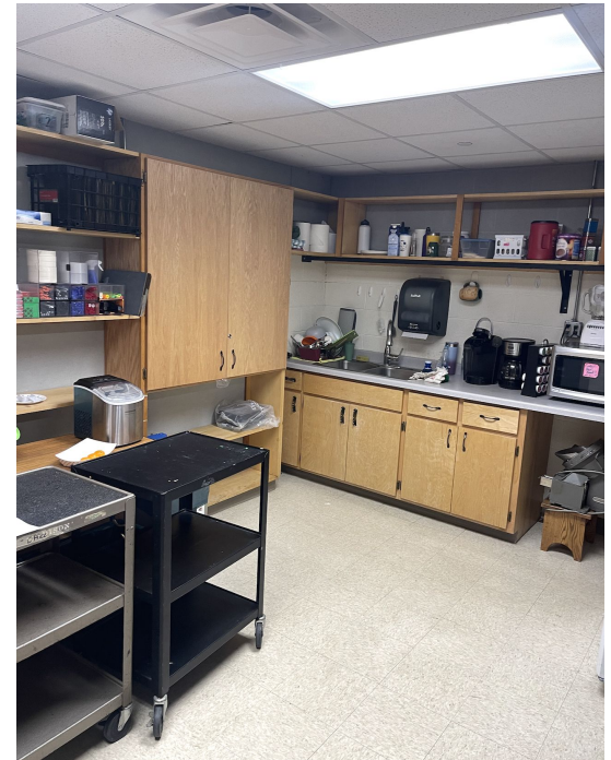
Main Office Workroom