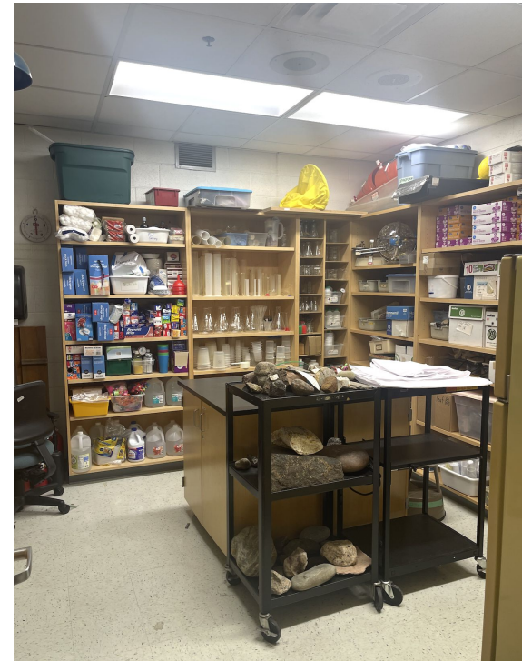
Science Storage Room Replacement