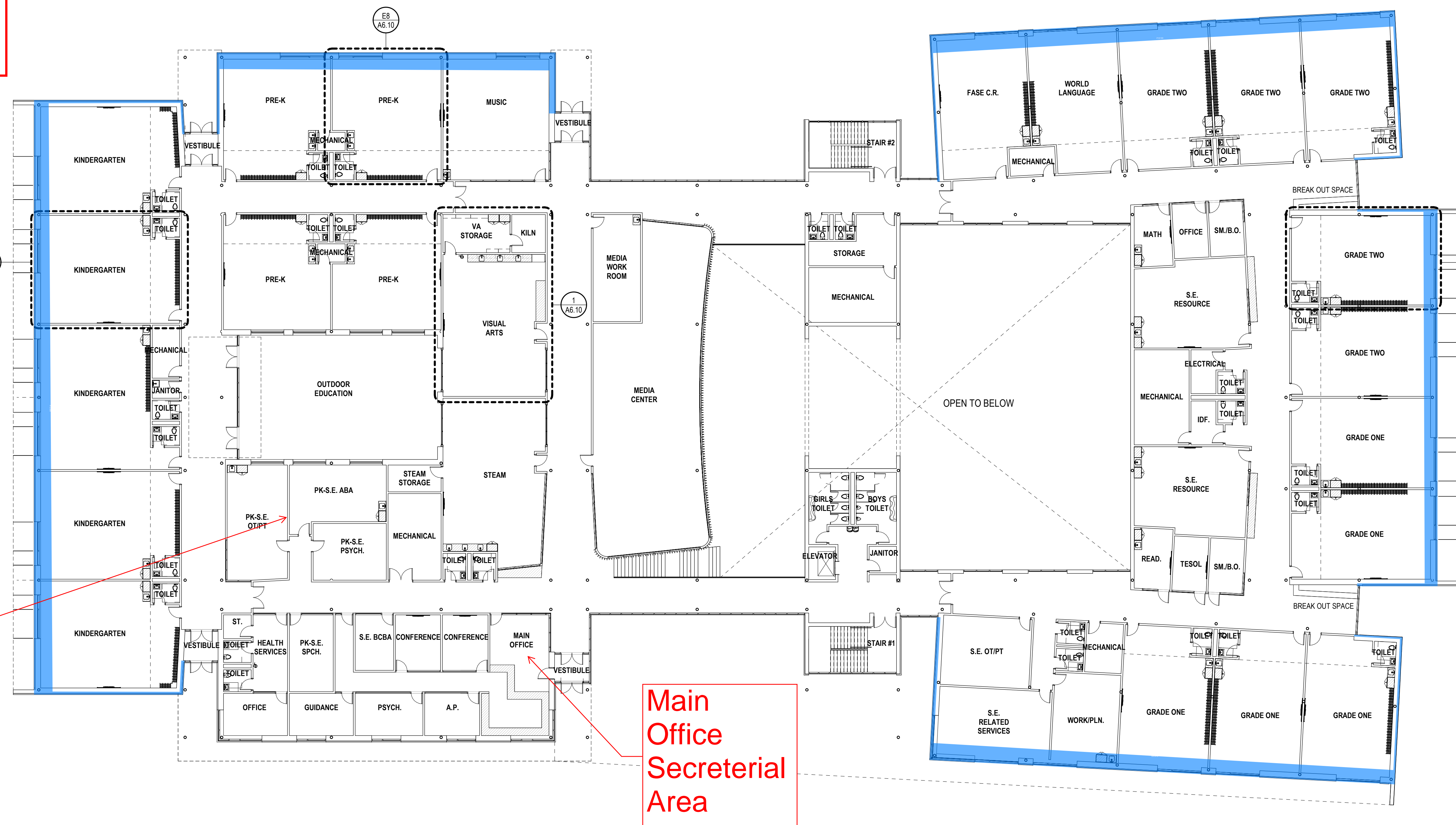
F10 MAIN LEVEL FLOOR PLAN 1/16" = 1'-0"