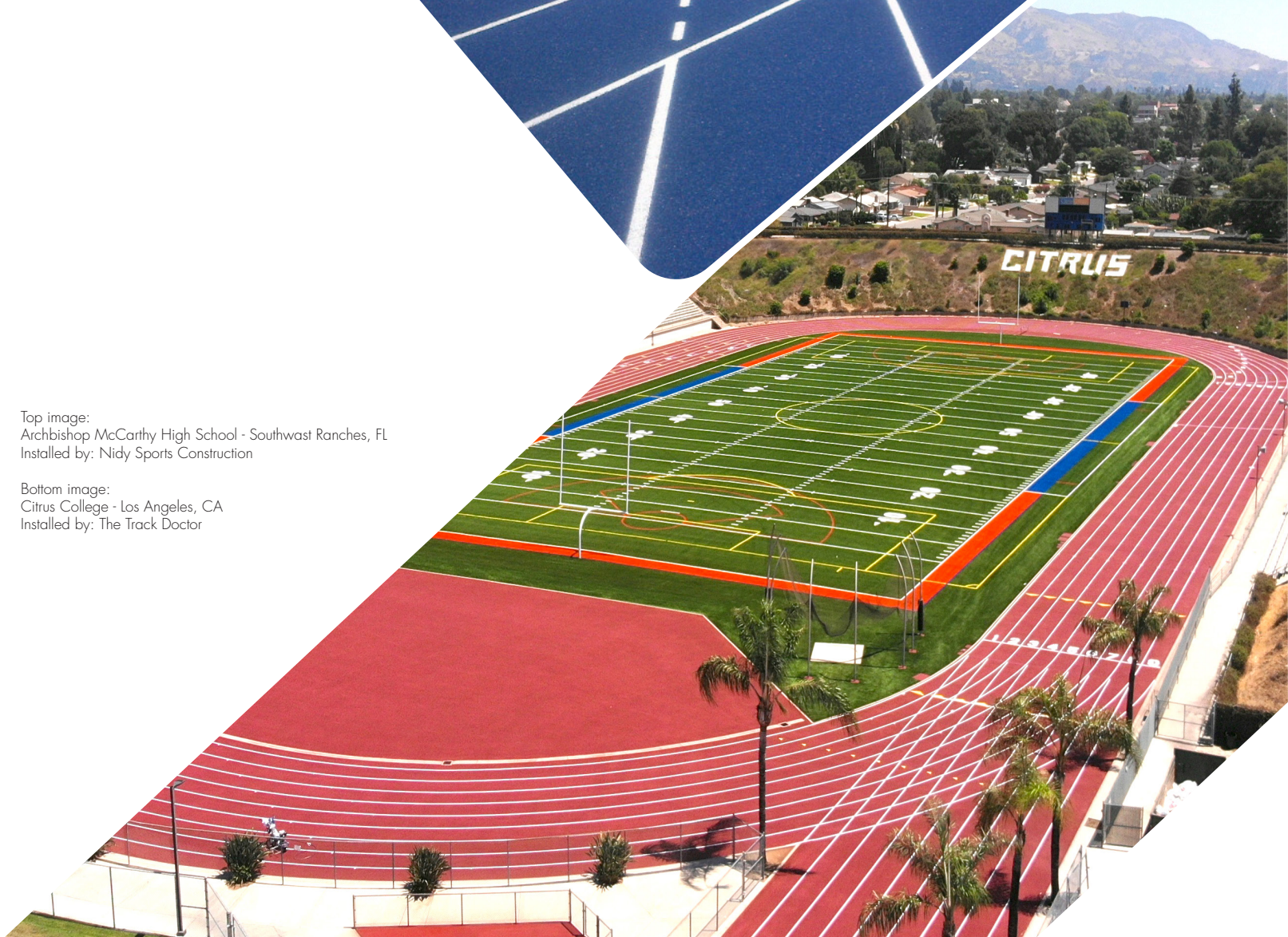
Bottom image: Citrus College - Los Angeles, CA Installed by: The Track Doctor