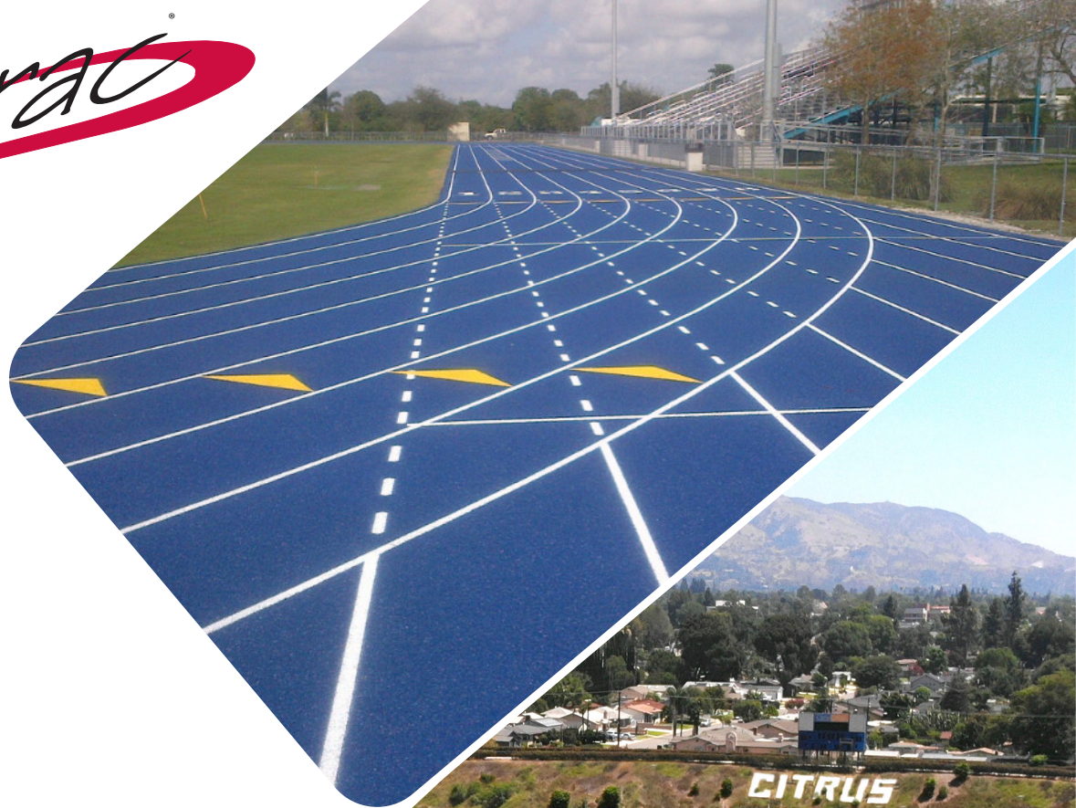
Top image: Archbishop McCarthy High School - Southwest Ranches, FL Installed by: Nidy Sports Construction