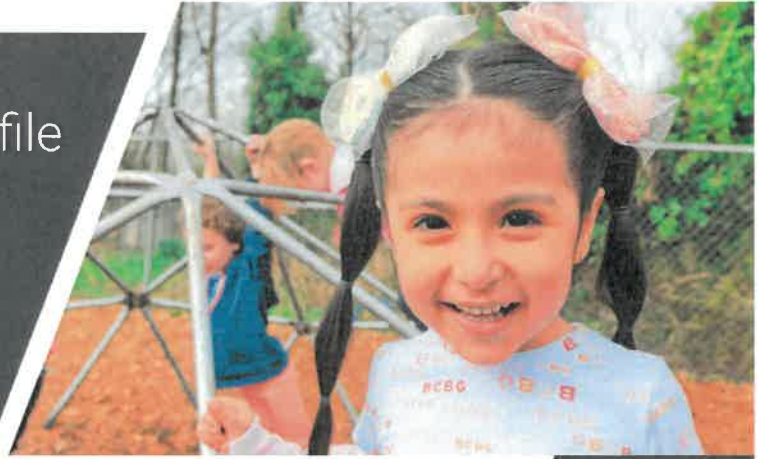
NWRESD's Early Learning Hub created a database of free preschools in Tillamook County . They coordinated photoshoots with Justin Grafton Studios so families could preview sites.

Schools: Nehalem Elementary School • Garibaldi Grade School • Neah-Kah-Nie Middle School • Neah-Kah-Nie High School