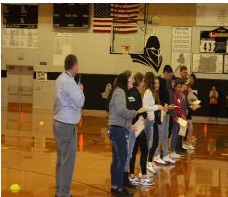
Honor Roll Students