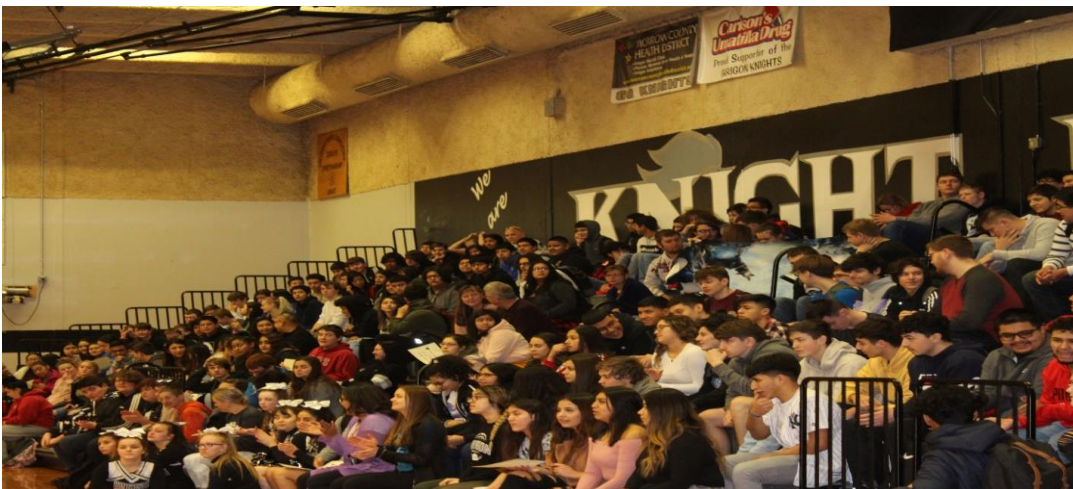
Irrigon Jr/Sr High School Student Body