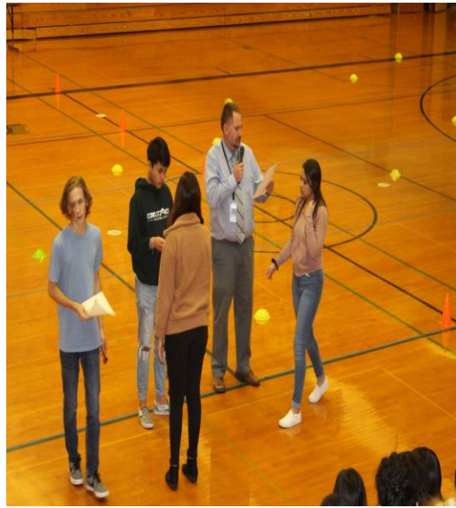
Honor Roll Students