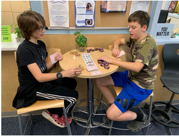
Students hard at play after school